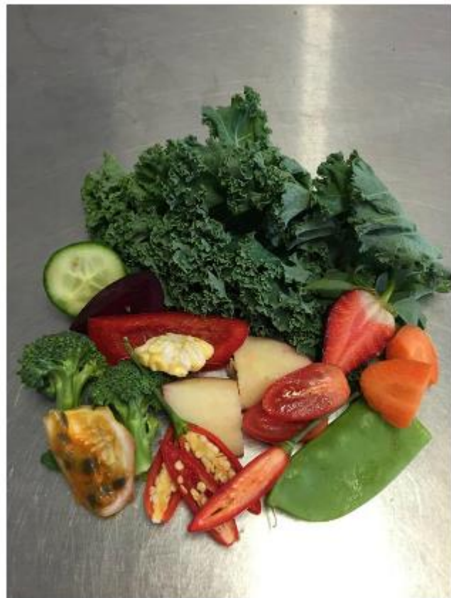
A daily portion of fruit and vegetables for Wally our Cockatoo. We recommend feeding 3/4 vegetables and 1/4 fruit.