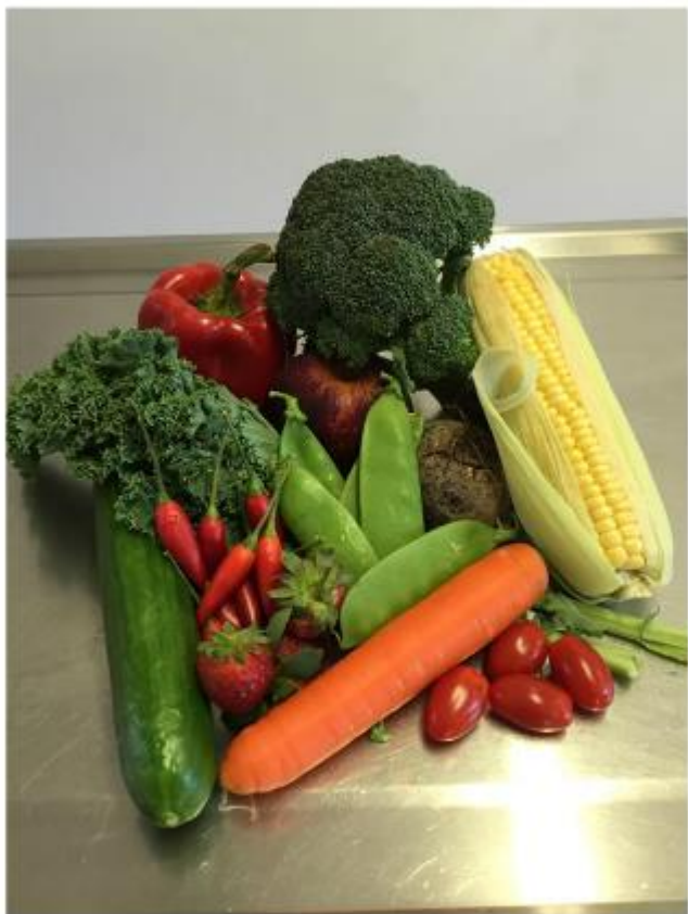
An example of fresh fruit and vegetables that you can provide for your bird. See our handouts as a guide for safe foods.