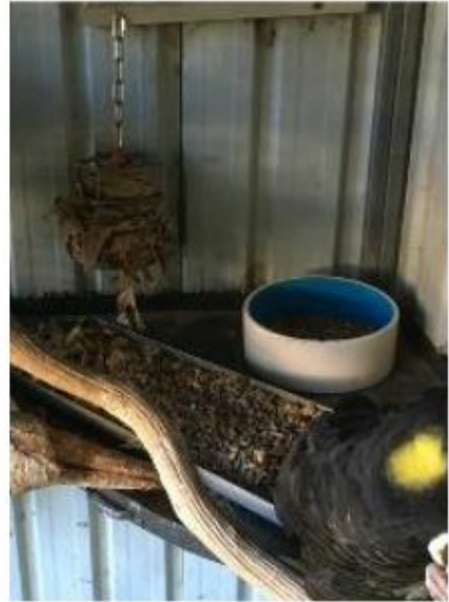
Forage Tray in Aviary